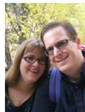
The "Thrifty Couple"