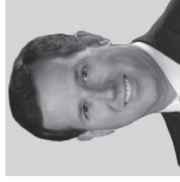
Rick Santorum Former Senator Republican ricksantorum.com