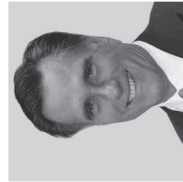
Mitt Romney Former Governor Republican mittromney.com