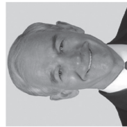
Ron Paul Congressman Republican ronpaul2012.com