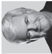
Newt Gingrich Former Speaker Republican newt.org