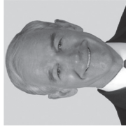
Ron Paul Congressman Republican ronpaul2012.com