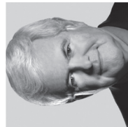
Newt Gingrich Former Speaker Republican newt.org

For more information visit www.illinoisfamily.org