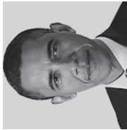
Barack Obama President Democrat barackobama.com