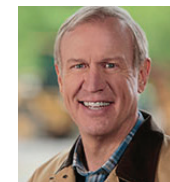
Bruce Rauner Businessman Republican brucerauer.com