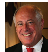
Pat Quinn Governor Democrat quinnforillinois.com