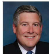
Kirk W. Dillard State Senator Republican kirkdillard.com