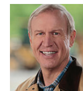
Bruce Rauner Businessman Republican bruce-rauner.com