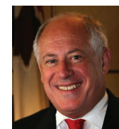
Pat Quinn Governor Democrat quinnforillinois.com