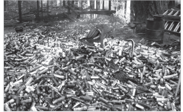
Explosion sight with butane canisters visible

Like Colorado, Illinois' bill allows for 5 plants per adult . Home grows, she said, are impossible to monitor plus it created another large non-taxable market referred to as the "grey market." Home growers have discovered they too can make